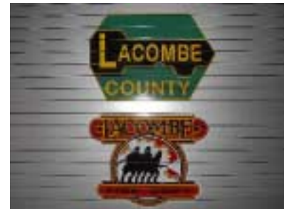
Above – Singly Owned Vehicle