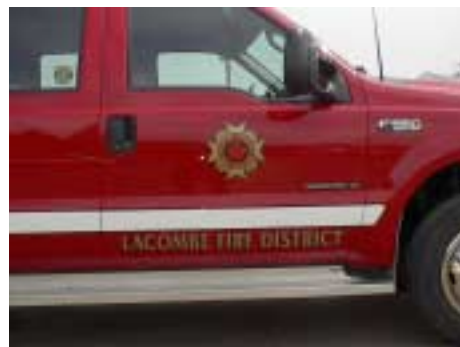
Above – Jointly Owned Vehicle